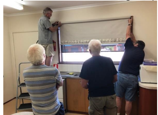
“This blind used to move up and down!”

It is now Monday afternoon and our team of volunteers have been working in the hall to clear furniture from the small room so that the carpet could be shampooed (thanks to Doug Hamilton). The new curtains are up and you can see the bright gold colour: