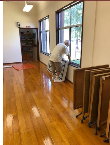
“I am sure that this window used to open!!!”

Last week a team of energetic volunteers entered the hall and started to put the furniture back as you can see from the photos: