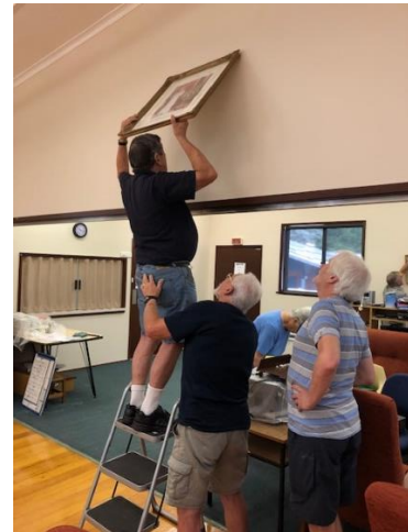
“How many men does it need to hang the Queen?”