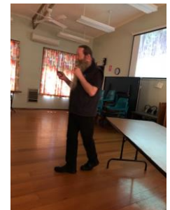
Scottie in full flight